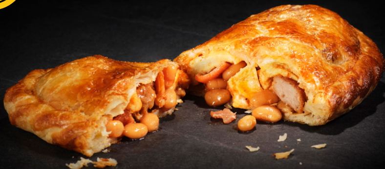
PROPER ENGLISH BREAKFAST PASTY