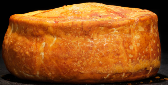
PROPER PORK PIE