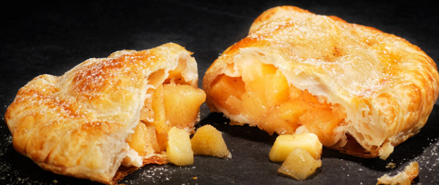
PROPER APPLE & CINNAMON PASTY