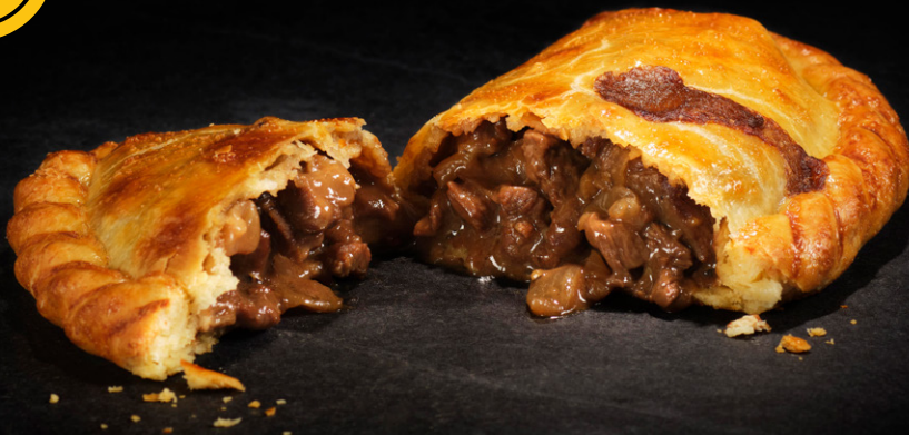
PROPER STEAK & ONION PASTY