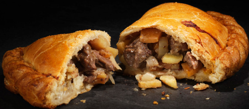
PROPER TRADITIONAL CORNISH PASTY