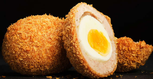
PROPER SCOTCH EGGS