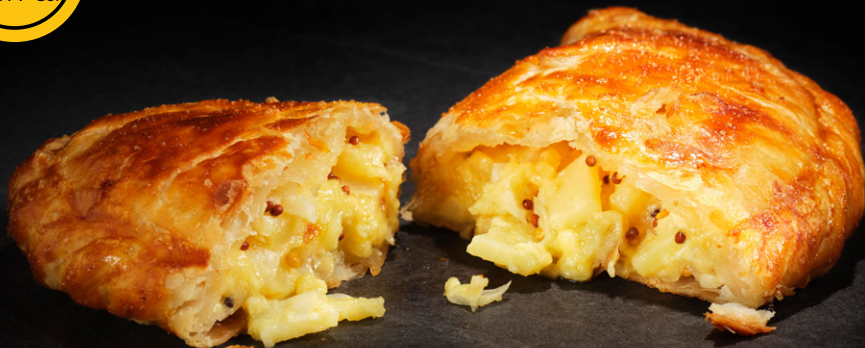
PROPER CHEESE & ONION PASTY