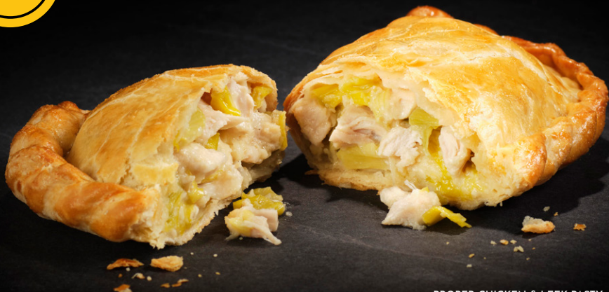
PROPER CHICKEN & LEEK PASTY